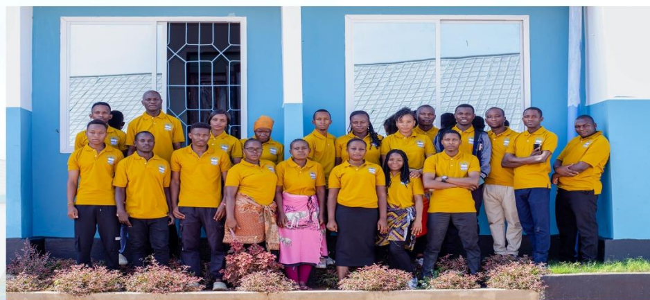
OTHER BAMMA'S STAFFS